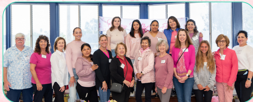
Birthline staff and volunteers at Love Another Mother.

The Love Another Mother event was beautifully organized...You could tell all the moms in attendance felt honored and loved. Thanks for the opportunity to volunteer!